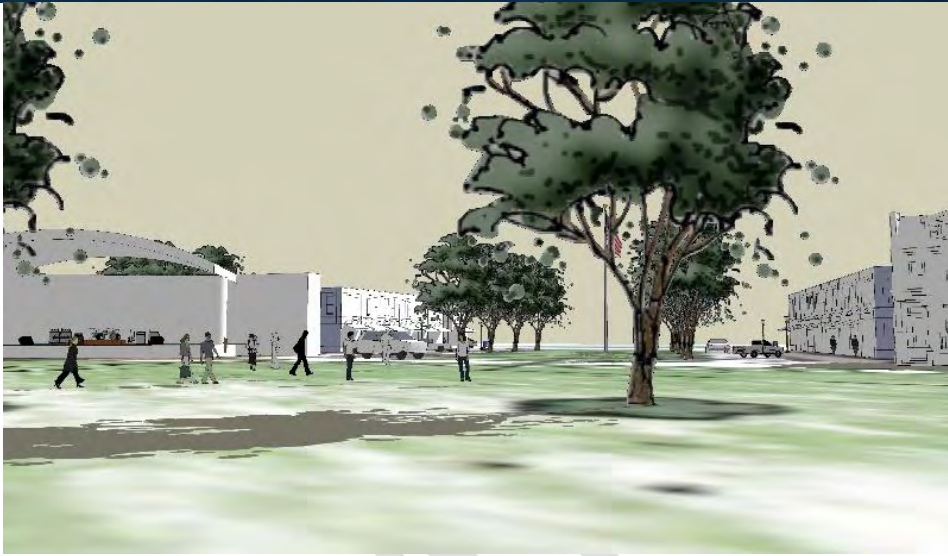
Figure 2: Town Green Rendering with Lake View