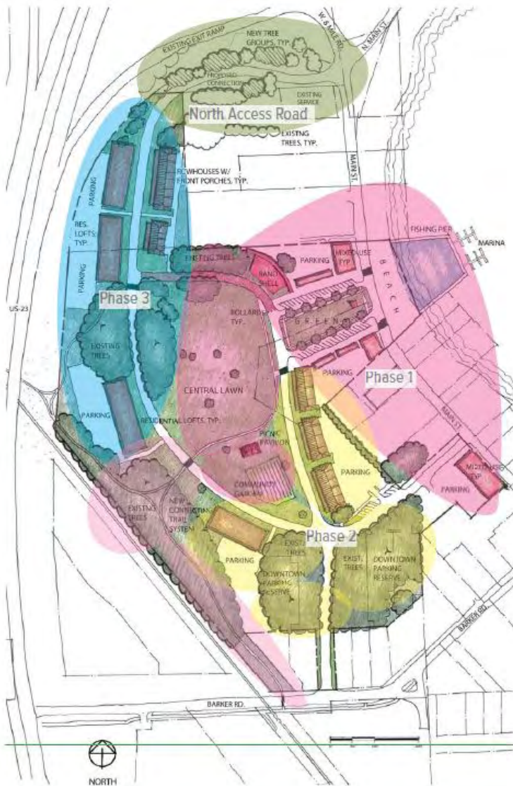
Figure 4: Phasing Plan: Park with Mixed Use – Moderate Development Intensity