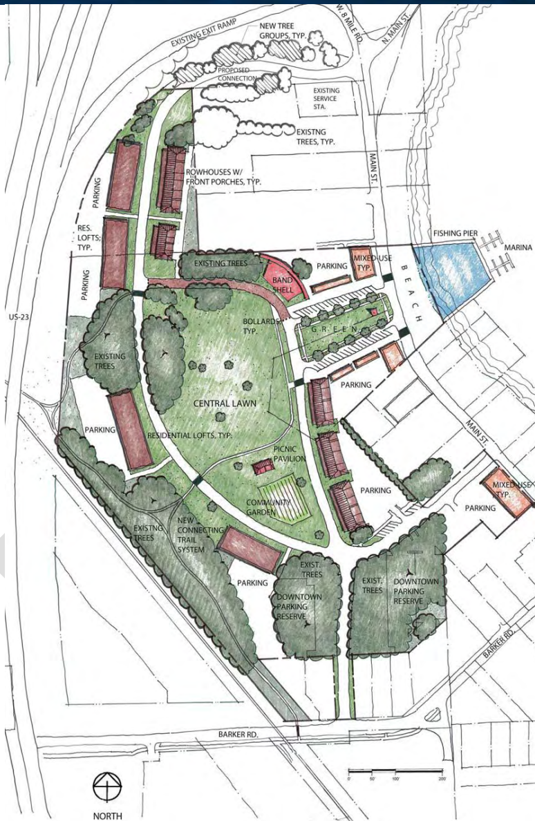
Figure 3: Park with Mixed Use - Moderate Development Intensity